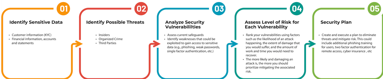
Figure 1: Operational Security Plan

At its core, operational governance ensures the security plan to protect a firm's most valuable assets is deployed and sustained. The process to identify the key elements of this plan are described in the following graphic.